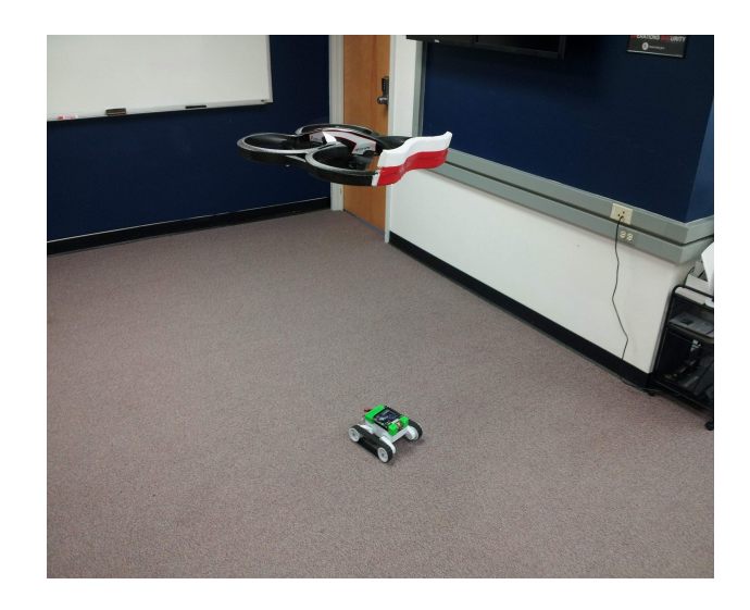
Figure UAF Search&Rescue System with the UAV flying over the UGV

The Parrot AR Drone 2.0 is an inexpensive, easy-to-control quadricopter, which combines an ARM A8 CPU running embedded Linux, an onboard IEEE 802.11 wireless network, and a sensor package including both pressure and ultrasonic altimeters, a 9-axis inertial measurement unit, and high definition video. This UAV is suitable for indoor use and has many built-in safety features such that it may be operated safely around people, including a soft foam hull that surrounds the propellers to prevent direct contact with objects such as people or walls, and a "kill switch" that immediately deactivates the motors if the propellers make contact with anything. The drone has two cameras, a low resolution 320x240 high frame rate 60fps camera looking down, and a high resolution 720p and moderate frame rate 30fps camera looking forward.