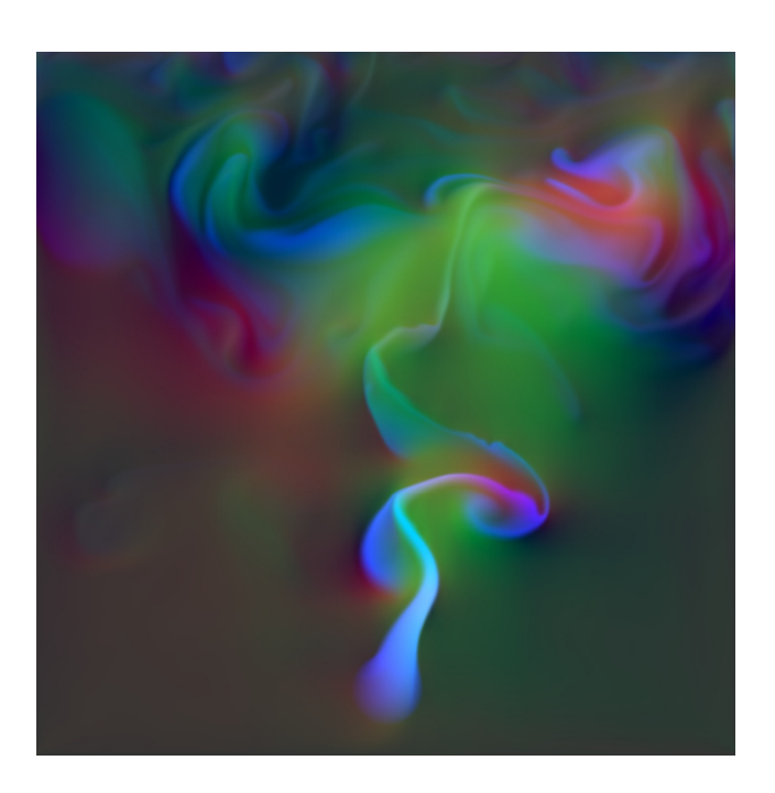
Figure 7: GLSL multigrid fluid dynamics, at 5ms/frame.

While paper primarily discusses OpenCL, this appendix discusses GLSL, the OpenGL Shading Language, a much older and more limited language. EPGPU's concept of FILL kernels is derived directly from GLSL.